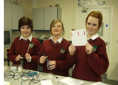
SciFest@School 2011 SciFest@Coláiste Lorcáin, Castledermot, Co Kildare